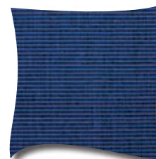
ROYAL BLUE TWEED