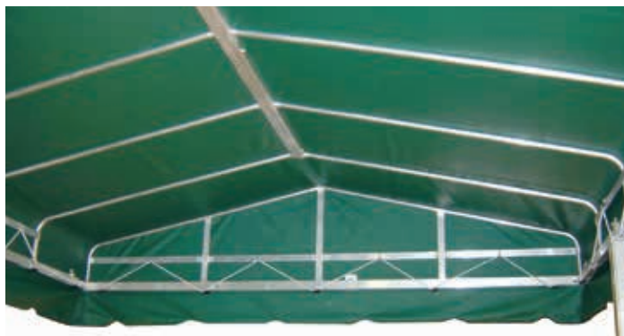
Sliding Canopy End

Remember, if it has to be waterproof, it has to be SeaMark™