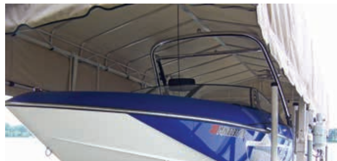
Additional depth with taller height allows entering the lift without lowering the tower. The tarp skirt is secured to prevent blowing in the wind.