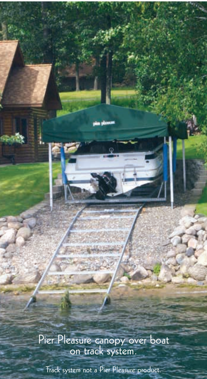
Pier Pleasure canopy over boat on track system.

Track system not a Pier Pleasure product.