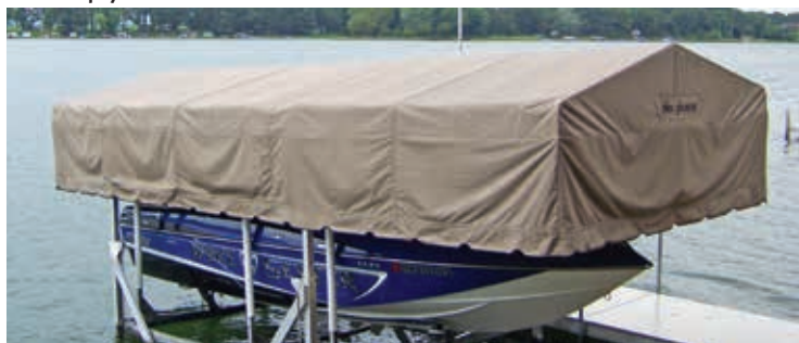
Skirt Extensions for the canopy tarp will provide additional protection for your boat from the sun, wind, rain and other damaging elements.